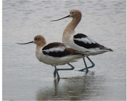
American Avocets

When accessible, this is one of the best spots in the country for viewing water birds year-round. The large sand flats are usually quite productive for Piping and Snowy Plover, Black Skimmer, and a variety of terns and gulls, at times hosting thousands of feeding shorebirds. Black Tern is common during fall migration. Check the