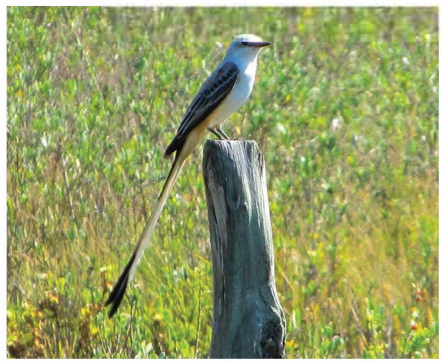
Scissor-tailed Flycatcher

Seafood and Steaks less than a mile ahead on the left before continuing. If not, continue to the next step.