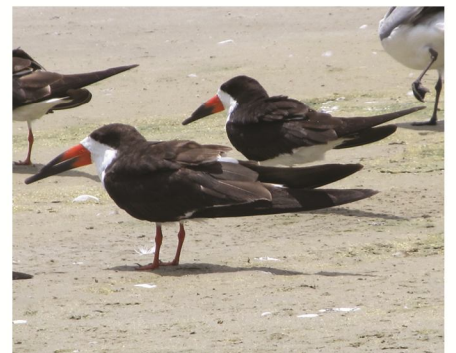
Black Skimmers

Turn on Boddeker Road (UTC 062) and pull into the parking area on the right before reaching the bridge. The sand spit across the water is excellent any time of year for Black Skimmer, American Avocet, Black-necked Stilt, Ruddy Turnstone, and various terns and gulls. In winter, check for Marbled Godwit, Black-bellied Plover, and Red-breasted Merganser.