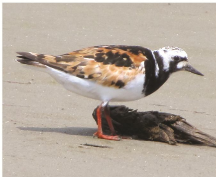
Ruddy Turnstone

In winter, Blue- and Green-winged Teal, Mottled Duck, Northern Shoveler, Gadwall, and other waterfowl are common. Check the power lines on the left for Loggerhead Shrike and Eurasian Collared-Dove.