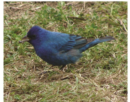
Indigo Bunting

Start your tour by visiting this small hidden gem, which can be found by taking TX 87 (Ferry Road) to TX 168. During spring, migrants including Indigo and Painted Bunting, House Finch, Baltimore Oriole, and various warblers are common. Check the small ponds year-round for Black- and Yellow-crowned Night-Heron, Little Blue and Green Heron, and other waders. Before you leave the parking lot, scan the power poles for Crested Caracara.