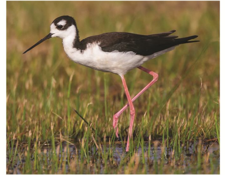
Black-necked Stilt

Note: only enter if the road is completely dry, as vehicles may get stuck when the access road is underwater. This area is good year-round for Sanderling, Willet, Least Sandpiper, and other shorebirds, as well as various gulls and terns.